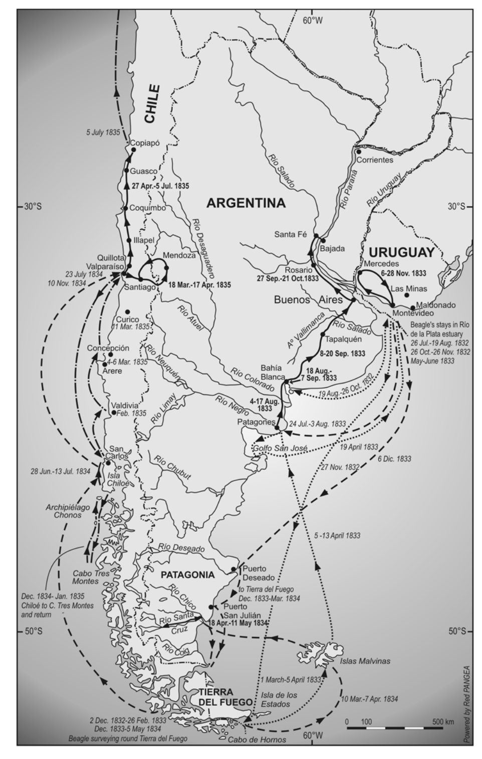
Figure 1: Journeys of HMS Beagle in southern South America (base map modified from Bowly 1990). Dates of Darwin's rides overland are shown in bold while the trips on board HMS Beagle are shown in italics, taken from Keynes (2001).

The third and more important fieldtrip was, after landing in Carmen de Patagones in August 1833 (Fig. 1), to ride across the Pampas to Buenos Aires city